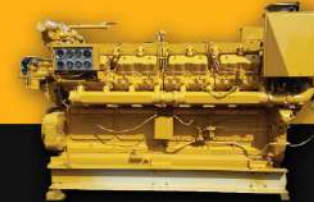
6.25" BORE VINTAGE SERIES