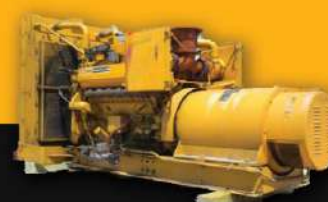
5.4" BORE VINTAGE SERIES